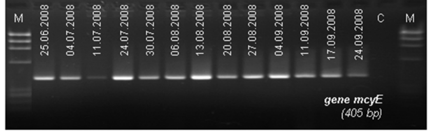
Jeziorsko - lowland reservoir in Central Poland.

In our last study comprising application of quantitative RT-PCR (based on 16S rRNA gene copies) the key factor for the development of cy-anobacteria in lowland dam reservoir was the water retention time (Gagała et al. in review). Shortening the retention time from 55 to 18 days resulted in a decrease in the average number of cyanobacteria, despite the favourable physicochemical conditions for the eutrophication (Fig. 2). It was observed that due to the poor hydrological conditions, the amount of toxic Microcystis genotypes (based on mcyA gene copies) increased to approx. 70% of the total amount of cyanobacteria (Fig. 2). It should also be noted that there were no significant differences in the mean concentrations of microcystins (1 µg/L